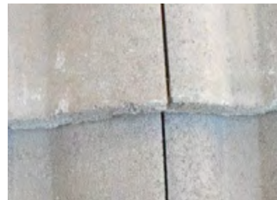
Figure 3. Properly repaired corner is not visible from the ground and maintains the water-shedding integrity of the tile. The important issue is to not use too much adhesive.