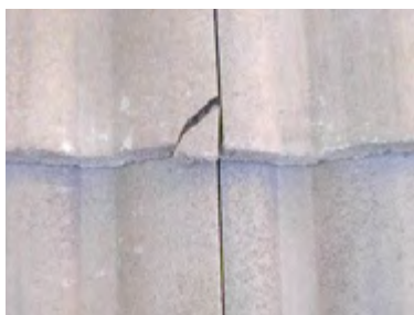
Figure 1. Broken cover lock corner