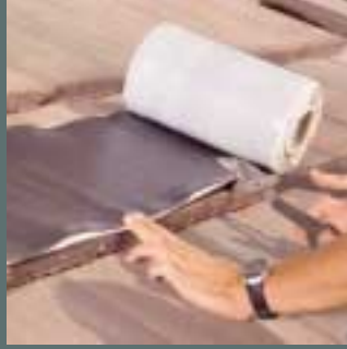
2. Measure appropriate length of Wakaflex and cut.