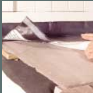
5. Remove backing from butyl adhesive strip.