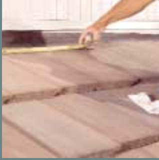
1. Measure area.