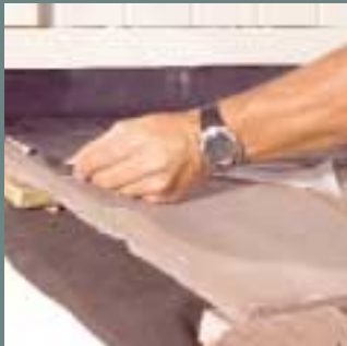
4. Place Wakaflex in position.