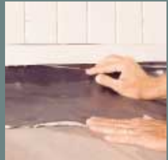
6. Apply Wakaflex to area.