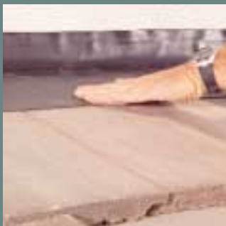
7. Smooth Wakaflex and conform to tile as you apply.