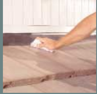
3. Clean area.