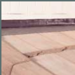
8. Finished installation.