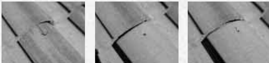
Figure 5: Fixing the clip in place

Install the cap by inserting the straight end of the clip through the nail hole of the cap (see Figure 5). Once the cap has been installed, the end of the clip is bent over to provide a more secure attachment and reduce the visibility of the clip from the ground.