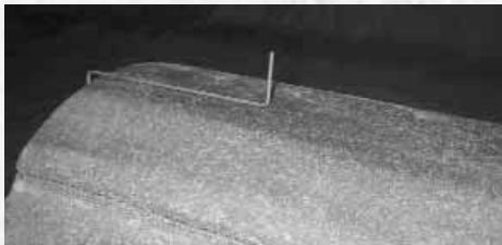
Figure 4: Clip over head of field tile