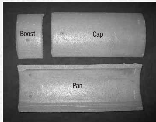
Figure 2: Separate pieces of Boosted Barcelona Tile