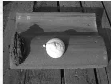
Figure 6: Polyurethane foam adhesive used in high wind regions

In high wind regions, applying concrete compatible adhesive is also recommended in addition to the mortar. The adhesive shown in Figure 6 is a two-part polyurethane foam that is applied in sufficient amount and location to form a firm bond between the cap and the field tile. Do not apply too much foam, which may have an adverse effect on the finished appearance as it can be visible from the sides.